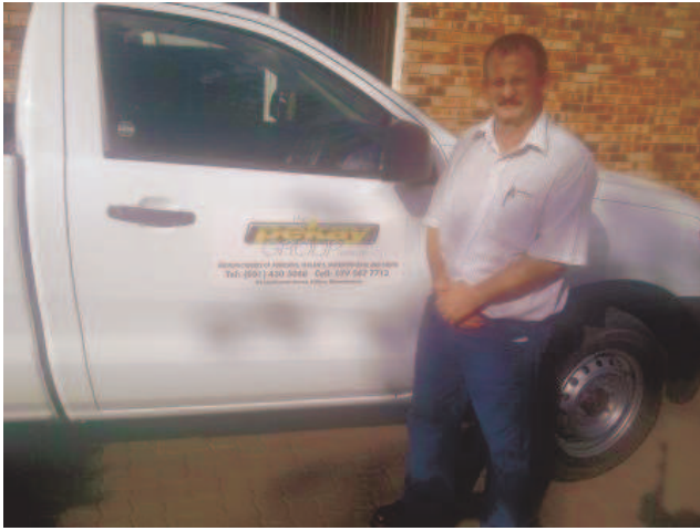
The new Ford Ranger for Bloemfontein